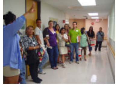
Patient Navigators do site visit of the Queen's Medical Center.

Foundation, DOH Breast & Cervical Cancer Control Program, American Cancer Society, Kapi`olani High Risk Breast Program, and National Cancer Institute. The final two days were